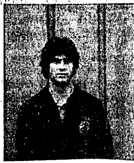
Awarded State Farmer Degree