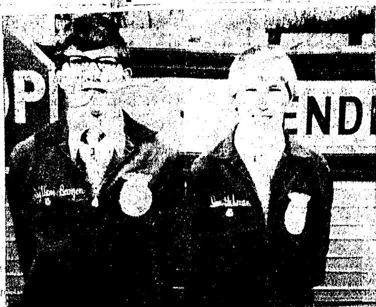
Kendrick Delegates to Leadership Conference—